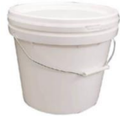
ROUND PAIL WHITE T/E 10 LITRE HEAVY DUTY