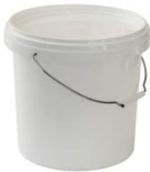
ROUND PAIL WHITE T/E 10 LITRE