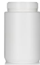
POWDER POT 2050 ml