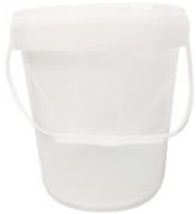
ROUND PAIL WHITE T/E 3.5 LITRE