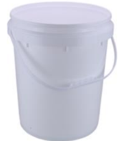
ROUND PAIL WHITE T/E 20 LITRE PLASTIC HANDLE