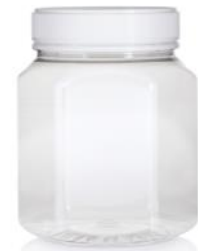
HEXAGON JAR 2 kg