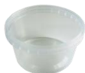
ROUND TUB CLEAR T/E 230 ml