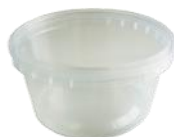
ROUND TUB CLEAR T/E 300 ml