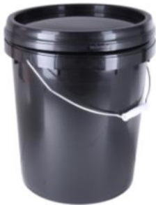
ROUND PAIL ENVIRO T/E 20 LITRE BLACK