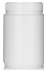
POWDER POT 1500 ml