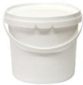
ROUND PAIL WHITE T/E 1.1 LITRE