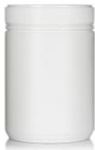
POWDER POT 1100 ml SHORT