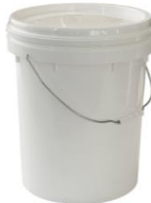
ROUND PAIL WHITE T/E 20 LITRE