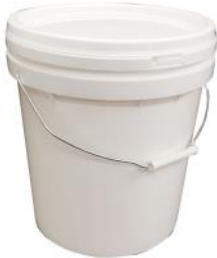
ROUND PAIL WHITE T/E 15 LITRE