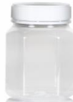
HEXAGON JAR 850 ml