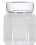
HEXAGON JAR 750 ml