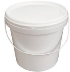
ROUND PAIL WHITE T/E 5 LITRE