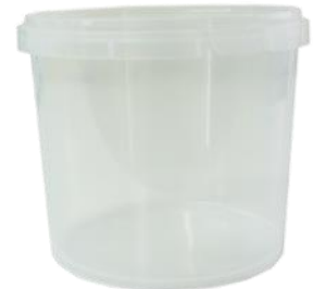
ROUND TUB CLEAR T/E 1.1 LITRE