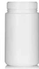
POWDER POT 1100 ml TALL