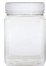
SQUARE JAR 2 KILOGRAM