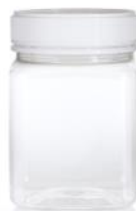
SQUARE JAR 1 KILOGRAM