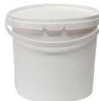
ROUND PAIL WHITE T/E 2.2 LITRE