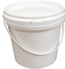
ROUND PAIL WHITE T/E 4 LITRE