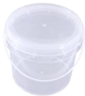
ROUND PAIL CLEAR T/E 1.5 LITRE