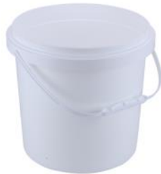
ROUND PAIL WHITE T/E 10 LITRE PLASTIC HANDLE