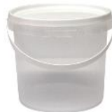
ROUND PAIL CLEAR T/E 1.1 LITRE