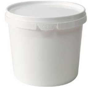
ROUND TUB WHITE T/E 250 ml