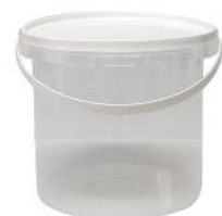
ROUND PAIL CLEAR T/E 2.2 LITRE