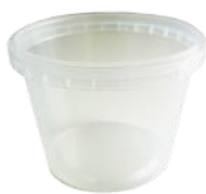
ROUND TUB CLEAR T/E 380 ml