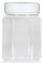
HEXAGON JAR 800 ml TALL