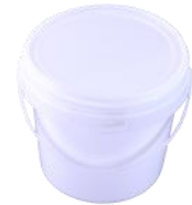
ROUND PAIL WHITE T/E 1.5 LITRE